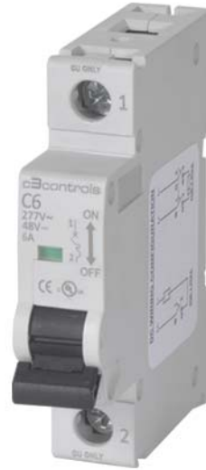
UL 1077 Supplementary Protector