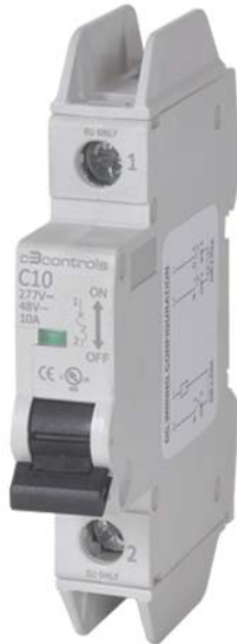
UL 489 Miniature Circuit Breaker